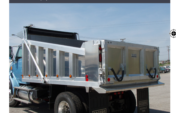
Various size heights available to match the capacity needs of your truck.