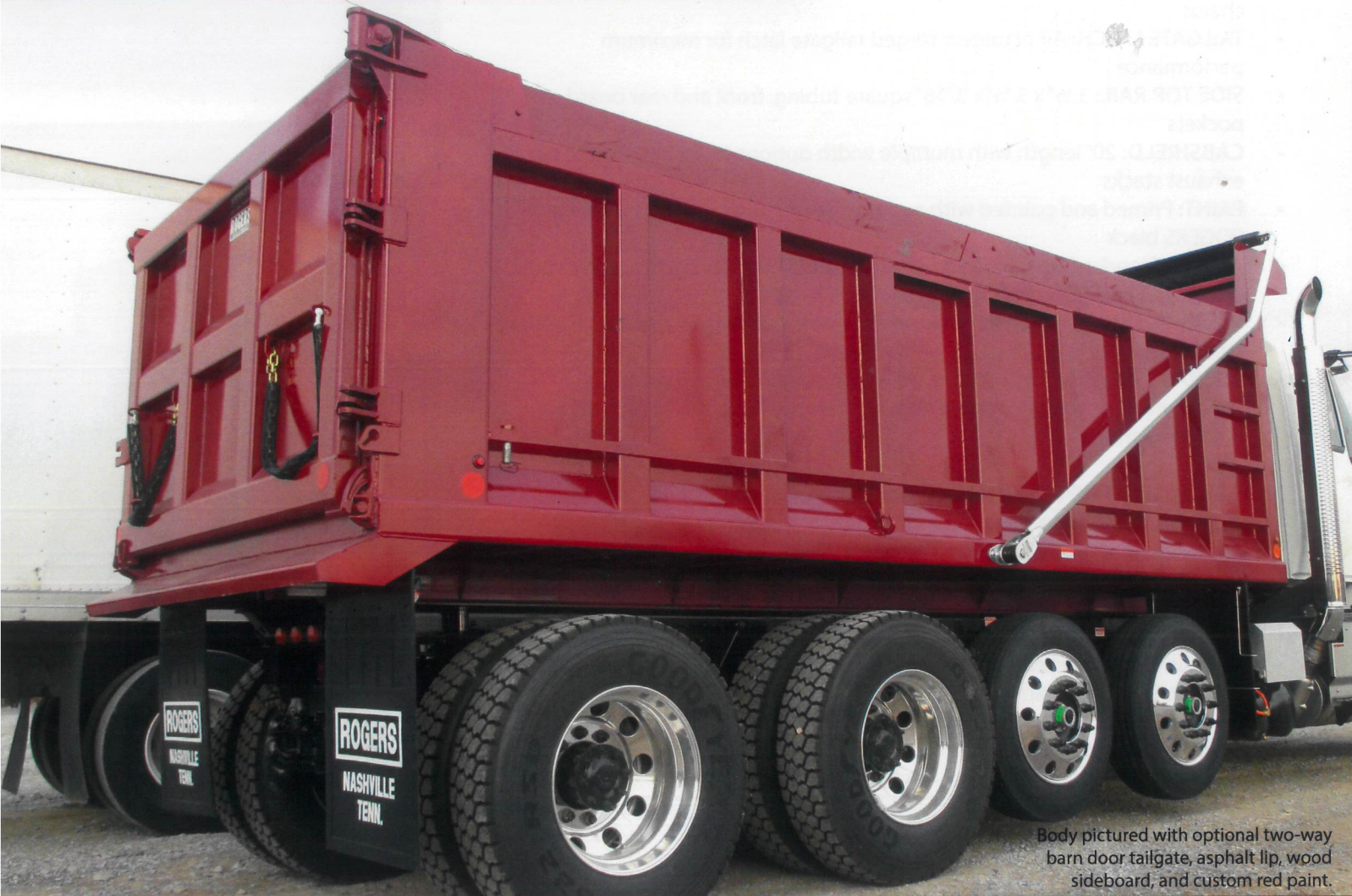
Body pictured with optional two-way barn door tailgate, asphalt lip, wood sideboard, and custom red paint.

The ROGERS R Series is ideally suited for standard materials such as sand, dirt, and gravel. Standard dimensions come in 8' width and lengths of 10 to 20 feet. Side heights vary depending on body length – see chart for details. Standard construction materials consist of 7 gauge steel for floor and hoist well, 10 gauge for sides and front. All steel is graded to be high tensile steel with minimum yield strength of 50,000 lbs. The body rests on a frame constructed of 6" longitudinal tubing and 4" channel cross members. A chassis subframe is available in all lengths but most common for 10-12 foot bodies. Tailgate bracing and side rub rails are sloped for material shedding. Inside chamfer strip extends the length of the body interior ensuring clean unloading of material. Additional features include full body length walk rod, electric tarp, air latch tailgate, and customer preference of in-cab controls (air or cable).